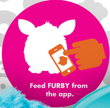
Feed FURBY from the app.