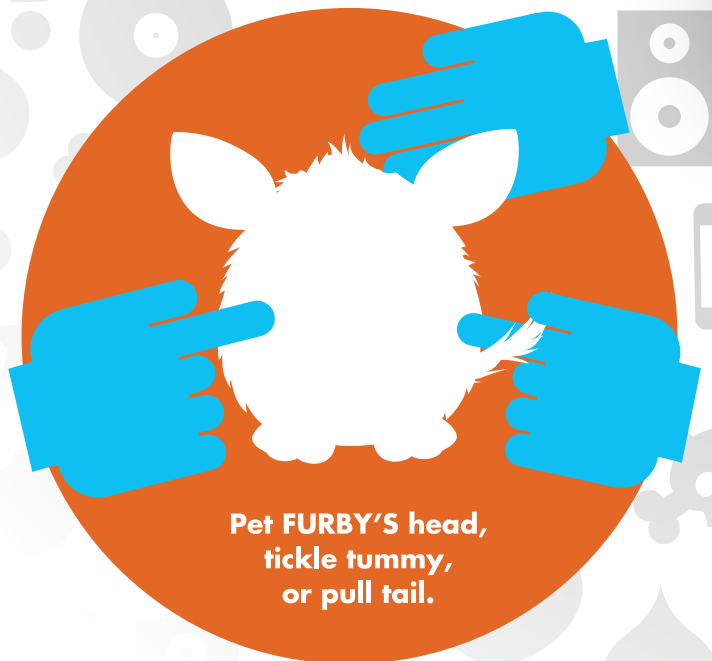
Pet FURBY'S head, tickle tummy, or pull tail.