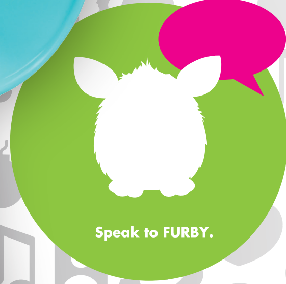
Speak to FURBY.