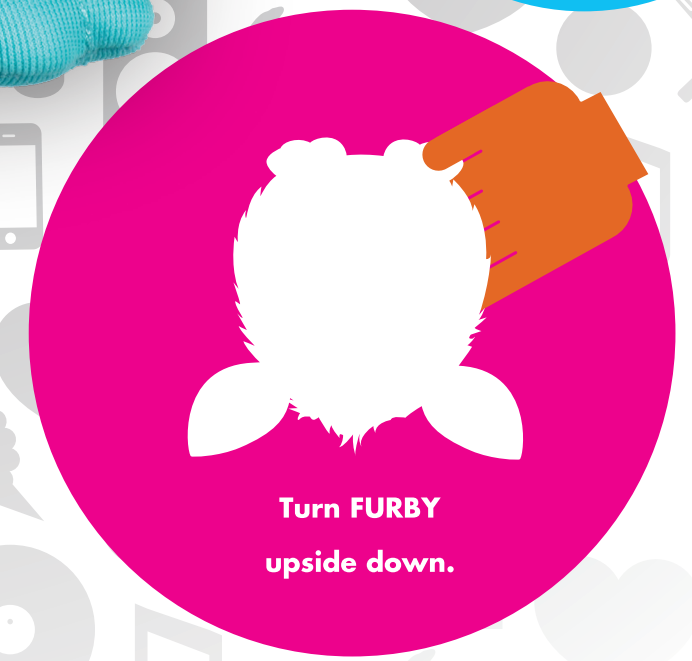
Turn FURBY upside down.

Get the free FURBY app! Available on the App Store Works with iPad®, iPod touch® & iPhone® - iOS 4.2 or later required. FURBY is fun on its own. For even more fun, get the app.