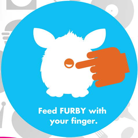
Feed FURBY with your finger.