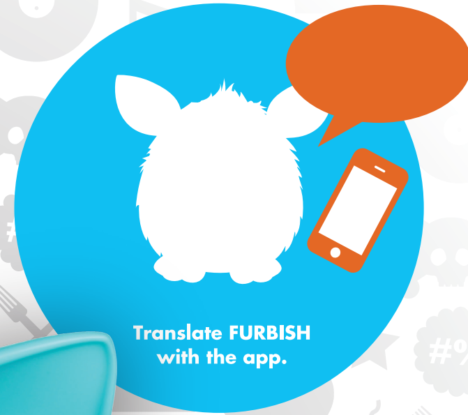
Translate FURBISH with the app.