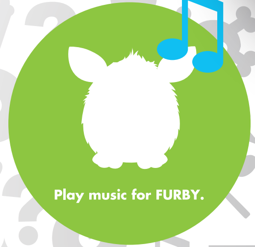
Play music for FURBY.